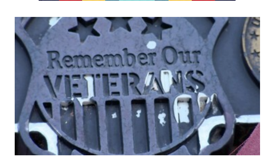
Non-heterosexual Veterans at higher risk of disordered eating

Palliative care can help prevent suicide in Veterans at high risk for death from other causes, according to a Corporal Michael J. Crescenz VA Medical Center study. Palliative care refers to care aiming to improve quality of life and reduce symptom burden in patients with complex and life-shortening conditions. Researchers looked at VA data on more than 580,000 patients who had a high risk of death within a year. A high percentage of Veterans who died by suicide were diagnosed with chronic pulmonary disease, as well as mental health and substance use conditions. One palliative care consultation in the 90 days before death decreased the odds of suicide by 71%. Two or more consultations lowered the risk of suicide by 78%. The results highlight the importance of palliative care in preventing suicide for patients with serious illness, say the researchers. (Journal of Pain and Symptom Management, April 28, 2022)