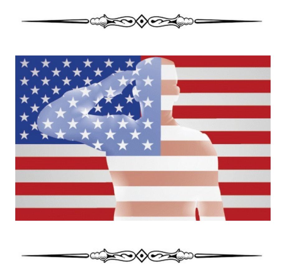
This Pride Month, VA is proud of all LGBTQ+ Veterans

Communication is fluid: the situation, information, and people we talk to shape how we deliver a message. For Veterans in gender transition, finding their voice can be enhanced with the help of specially trained speech-language pathologists (SLPs). The Gender Affirming Program for Speech (GAPS), is a collaborative project between VA's LGBTQ+ Health Program, the Audiology & Speech Program Office, and the ORH Veterans Rural Health Resource Center in Portland, Oregon, to provide voice and communication training for transgender and gender diverse Veterans.