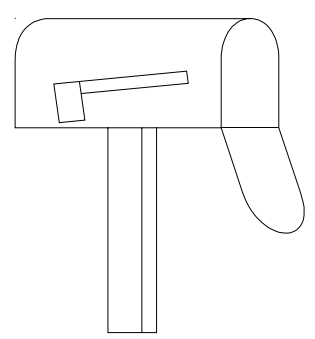
The next Afterburner should be be delivered to your mail box in December.

It's important to send the change of address to the correct location to ensure the change is made in a timely manner. Please note that the London, Ken., address below is a contractor that films the written request as a computer image and transmits it to the Cleveland pay center.