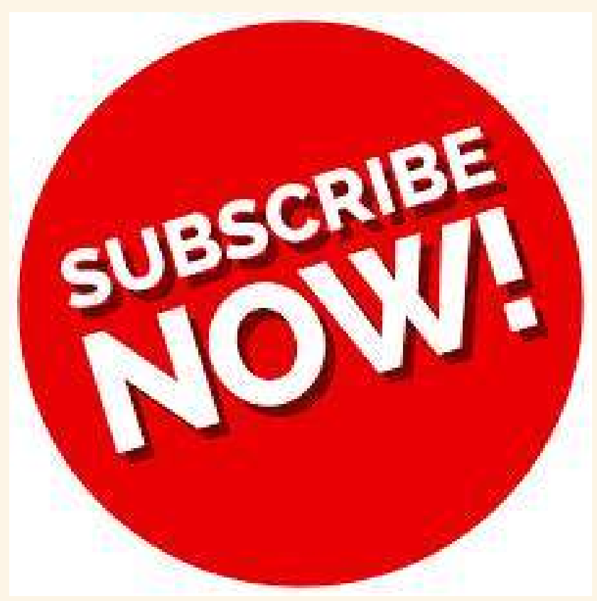
Click here to subscribe!

If you received this newsletter as a courtesy or a forward from a friend or relative, you can sign up to receive in your E-mail every week.