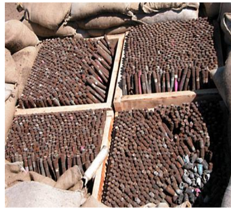
Figure 2 Military debris recovered from Fort Ord

Much of the debris and other munitions have been removed, but there are still sites where weapons are located beneath the ground’s surface. Most likely they were detonated long ago and do not present an explosive risk, but live munitions have been