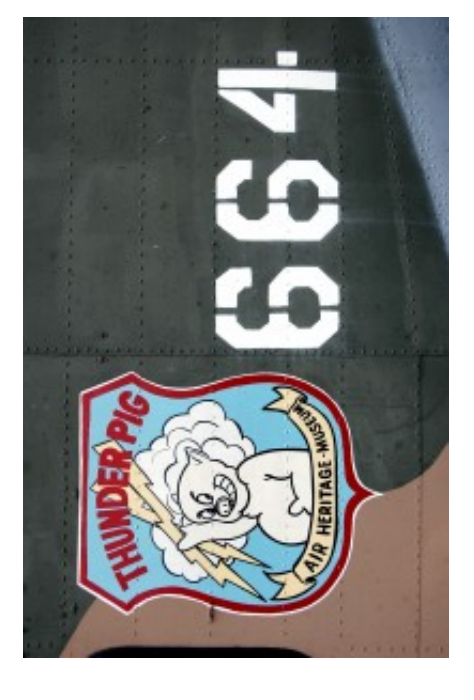
History of C-123K Serial # 54-664

to Air Force Reserve Units and finally to storage at Davis-Monthan AFB. The last military mission for the Provider was a UC-123 unit based American C-123s were either withdrawn or turned over to the South Vietnam, Thailand, or Cambodia. The only American flown C-123s still with night surveillance sensors for detecting trucks and bomblet despondors under Project Black Spot. Other C-123's known as candlesticks, in Southeast Asia were those belonging to Air America., the shadow airline financed by the CIA. After Vietnam the C-123s were transferred Two Providers were modified to the NC-123K configuration which was fitted at Rickenbacker ANGB outside of Columbus, Ohio which was formed to spray anti-mosquito agents around areas of high infestation. were fitted with bulk flare dispensers to support night attack missions. When the United States began de-escalating the war in 1970 folding cover.