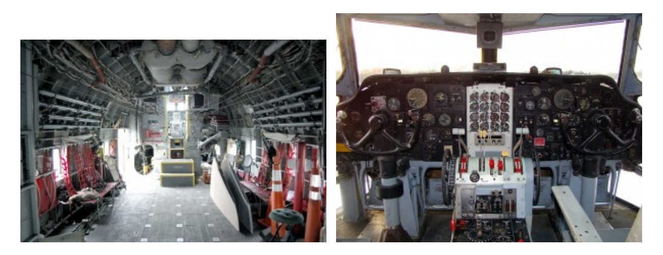
Figure 1 . Photographs of the interior of UC-664, serial number 54-664, following restoration in September 1971 at the Hayes Aircraft facility, Napier Field, Alabama [15].

When the 19 aircraft were at the Hayes Aircraft facility, it was necessary to install new heaters, windshield defrosting systems, new stanchions and litters, new oxygen systems, etc. They also had to remove the protective seats that had been modified for the RANCH HAND pilot and copilot. The protective materials were removed and new seats and clean-up of the instrument panels were part of the reconditioning. Areas in the aircraft damaged from ground fire and heavy use were repaired and replaced, including flooring and side panels. The interior of the aircraft were cleaned of dust and waste materials. The engines and operating systems were reconditioned as necessary, and exterior and interior painting was done as appropriate for their new assignments with the Air Force Reserve units. Figure 1 is a photograph of the former UC-664 after it had been reconditioned and restored [15].