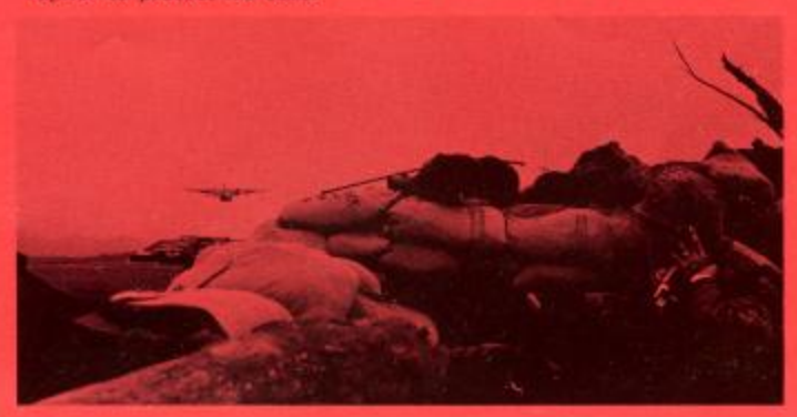
DECEMBER 1968 . PAGE SEVEN

C-123 taking off from strip at Khe Sanh. Aircraft has been backbone of airlift in Vietnam. Noise from jet engines causes combat photographer to protect his ears.