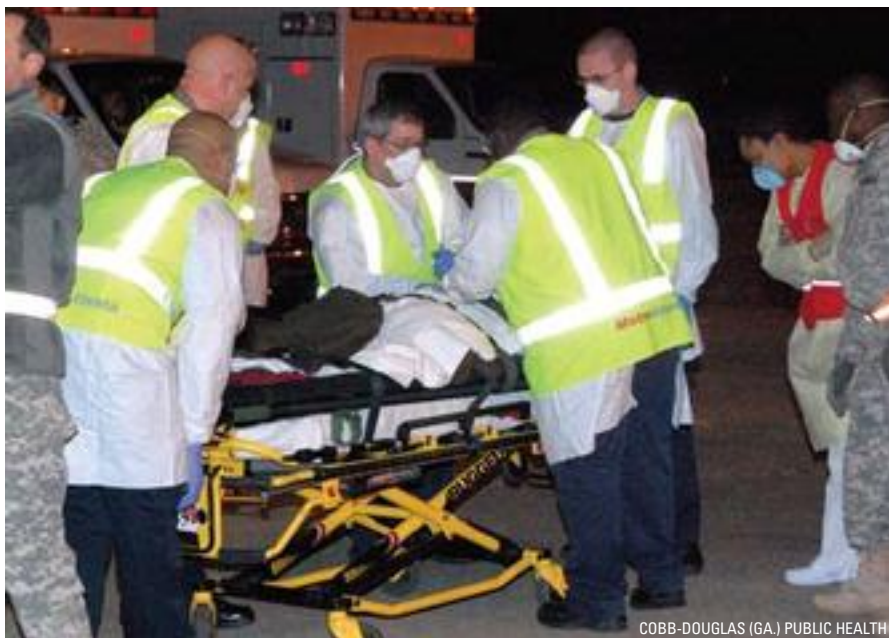
COBB-DOUGLAS (GA.) PUBLIC HEALTH