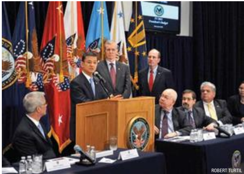
VA Secretary Eric K. Shinseki speaks at a briefing on the release of the 2012 budget proposal on Feb. 14 at VA Central Office.

The funding request includes nearly $940 million for specific programs to prevent and reduce homelessness among veterans and their families. This funding is a 17 percent increase over the current budget of nearly $800 million.