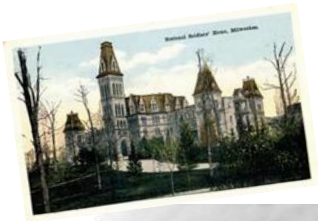
Historic images like these, of the Milwaukee VA and of women stuffing benefit checks, need to be preserved.