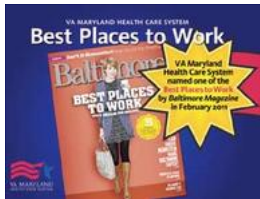
Baltimore Magazine's Best Places to Work issue recognizes businesses based on pay, perks and benefits.

In the February issue of Baltimore Magazine , the VA Maryland Health Care System was named one of the Best Places to Work. Baltimore Magazine's Best Places to Work issue recognizes businesses based on pay, perks and benefits.