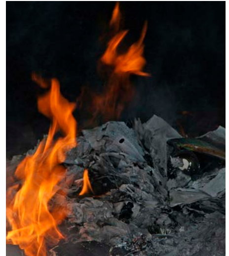
The use of burn pits, area devoted to open-air combustion of trash, was a common waste disposal practice at military sites outside the United States, such as in Iraq and Afghanistan.

The Health and Medicine Division (HMD), formerly known as the Institute of Medicine, of the National Academy of Sciences, Engineering, and Medicine (the Academies) will release a new report later this year on the VA Airborne Hazards and Open Burn Pit Registry. The report will include recommendations on collecting, maintaining, and monitoring information collected by the registry. The Academies are private, nonprofit institutions that provide analysis and advice, and operate under a congressional charter.