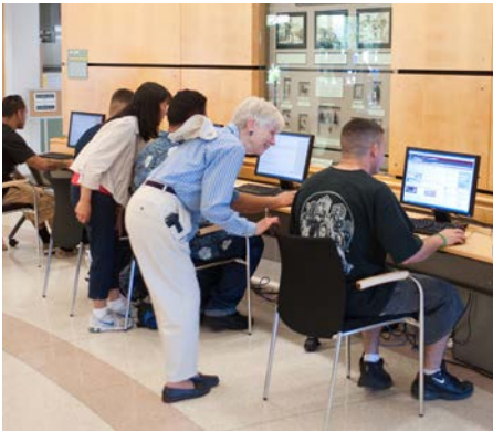
A Veterans Affairs employee assists an Inactive Ready Reserve Marine in registering for My HealtheVet at the Palo Alto VA Medical Center.