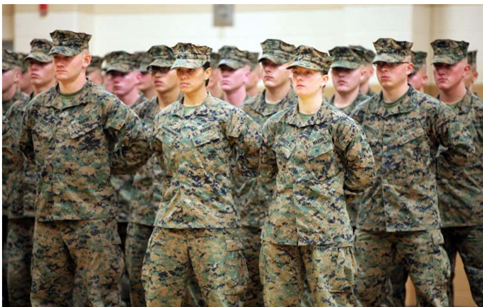
U.S. Marines stand at parade rest during a graduation ceremony.

VA is committed to understanding the health effects of military sexual trauma (MST) and providing resources for Veterans who have experienced it. MST is sexual harassment or sexual assault that happens during military service. It can happen to both men and women, and can continue to affect Veterans after they leave the military.