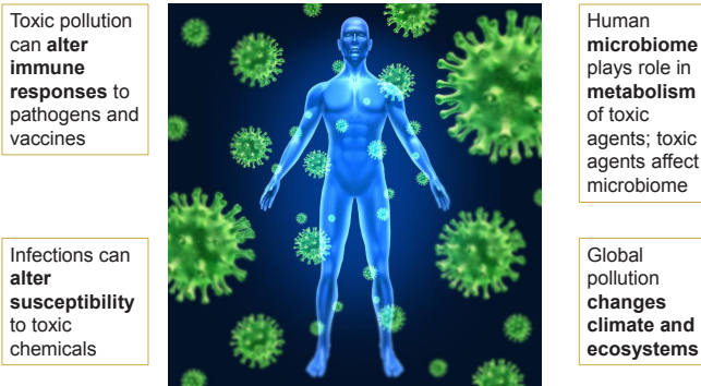
FIGURE 2 How do environmental chemicals and microbial agents interact?