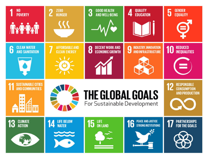
FIGURE 1 United Nations' Sustainable Development Goals.

Environmental threats such as pollution and climate change have historically gone "largely ignored in global health" despite the enormous impact they have on the health of people and the planet, stated Keith Martin of the Consortium of Universities for Global Health (CUGH). Factors that influence the spread of infectious diseases include climate change, environmental pollution, poor water quality and sanitation, food insecurity, environmental degradation, biodiversity loss, natural and anthropogenically caused disasters, and poor governance. Martin asked, "how do we deal with a planet that is crying out 911 as we are destroying the ecosystem services that keep us and all species alive