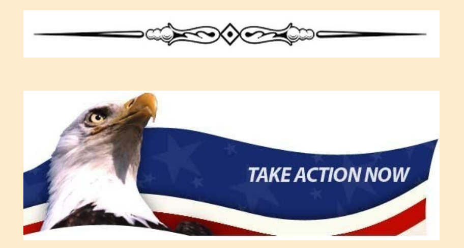
H.R. 5693, the Long-Term Care Veterans Choice Act

Every Navy command has a Voting Assistance Officer (VAO) who can assist those who are unsure of what they need to do to exercise their right to vote Nov. 6. Besides accessing the Federal Voting Assistance Program (FVAP) website, voters can speak directly with a voting assistance officer who acts as the resource for all voting-related questions. It is not too late to register to vote. Registration for all states can be handled at the FVAP website. U.S. Citizens over the age of 18 who wish to vote in their state of residence can fill out the Federal Post Card Application (FPCA) to register and also request their absentee ballot for the election. For more information, contact your local VAO.