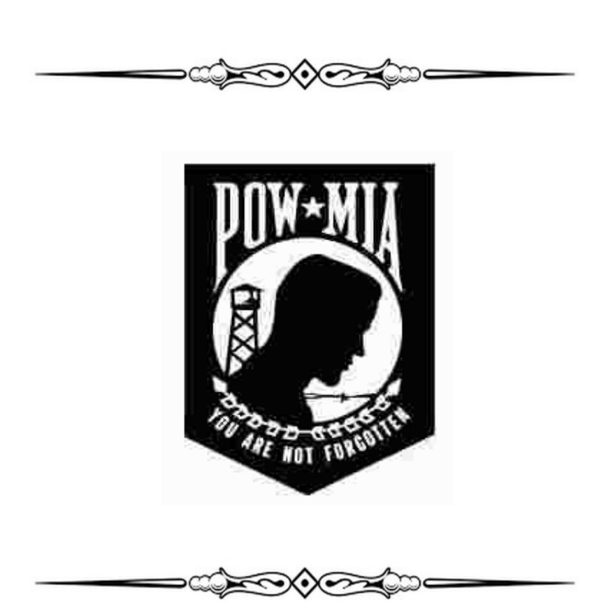
Guam-based Vietnam Vets Seek Benefits

The Department of Veterans Affairs' (VA's) Whole Health approach aims to let veterans take charge of their health based on their priorities with the support of Whole Health peer facilitators on their health team. For more information, read the VA VAntage Point Blog and listen to the video online. To learn more about Whole Health, visit the VA Office of Patient Centered Care and Cultural Transformation website.