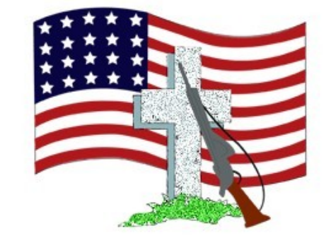
ALL GAVE SOME, SOME GAVE ALL