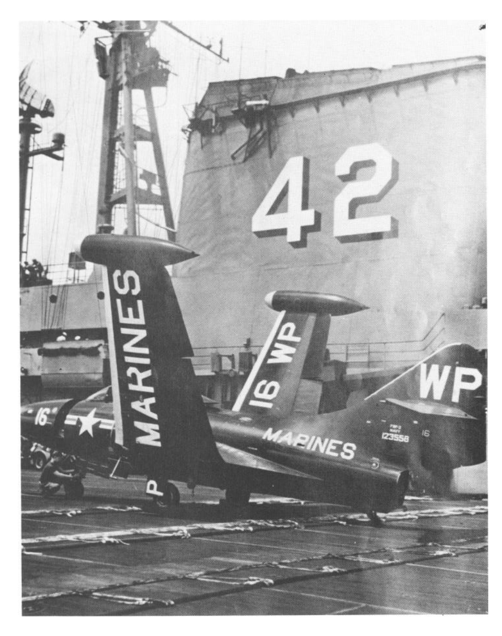
Marine jet fighters went to sea with the Grumman F9F Panther.

The types which most advanced Marine Aviation capability during this nine year period were the jet fighter and attack aircraft, helicopters, and the turboprop transport. It all began in 1947 with the commissioning of HMX-1 at Quantico to develop the use of helicopters, and VMF-122 flying the first jet, the FH-1 Phantom at Cherry Point. These were closely followed by VMF-311 at El Toro in 1948, first with TO-1s (F-80Cs), the Lockheed Shooting Starfor jet indoctrination of experienced pilots, and then late in 1949 operating the F9F Panther for normal fighter/attack training. But the aircraft that heralded the rapid advance of technology with the loudest