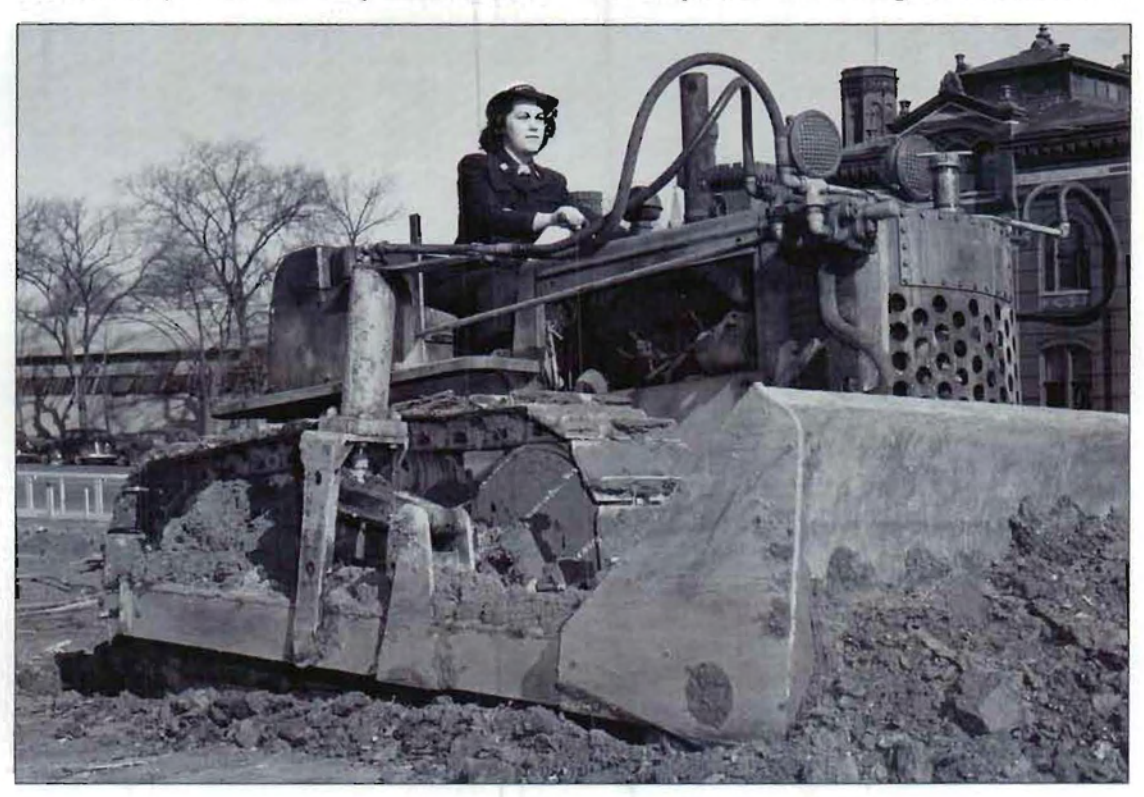
The Coast Guard pictured World War II SPARs as attractive, wholesome, impeccably groomed young women. It is rare to find a nonstaged Coast Guard photograph of a SPAR.

their period of training. After training, a SPAR may marry a civilian or a serviceman who is not in the Coast Guard." A SPAR who became pregnant "must submit her resignation promptly."