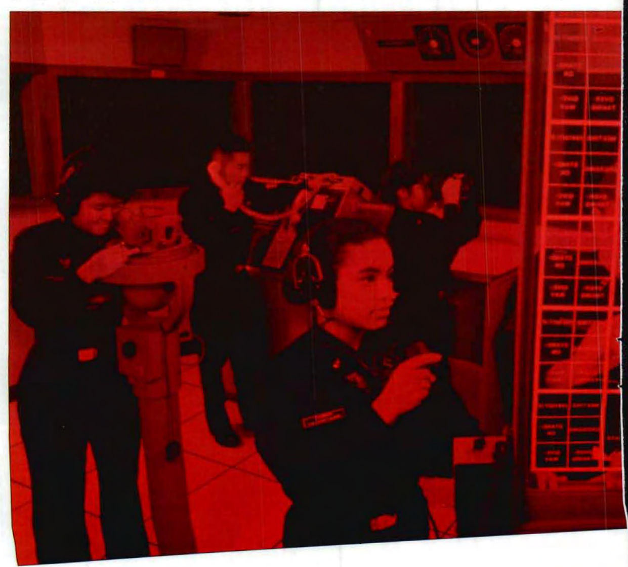
The Coast Guard Academy began admitting women in 1975. Its four-year curriculum includes nautical and academic training.

The concept initially got a cool reception aboard the vessels in question. Legend had it that the Morgenthau's radio call sign, NDWA, meant "no damn women aboard." The crews of the two cutters were put through extensive briefings regarding the conduct that was expected of them, and