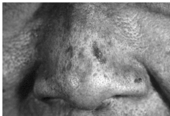
Fig. 1 Denuded blisters on the nose.

On further investigation, she was discovered to have a positive urine porphyrin (Fig. 2). Blood porphyrin and stool porphyrin were however not detected. Further sections of the skin specimen were stained for periodic acid-Schiff (PAS) and these showed cuffs of PAS positive material around the small vessel walls in the dermal papillae and upper dermis (Fig. 3). Other tests to investigate for underlying disorders including the ultrasonography of the hepatobiliary system, hepatitis screen, serum liver function test were