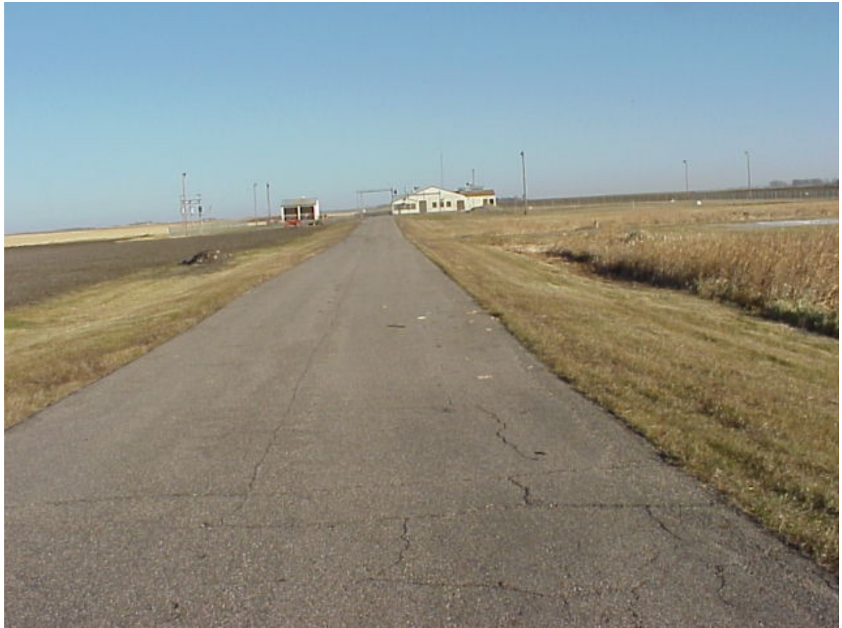
Figure B-0-3. View of Access Road of Former Missile Alert Facility B-0 Facing North