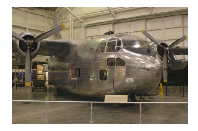
"Patches" Tail #362 Air Force Museum Wright-Patterson AFB, Ohio, after decontamination

To Establish the fact of Individual Veteran's Agent Orange Exposure per Department of Veterans Affairs Justification of designation of these aircraft as Agent Orange Exposure Sites