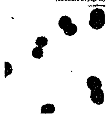
Electronphotomicrograph of Neisseria