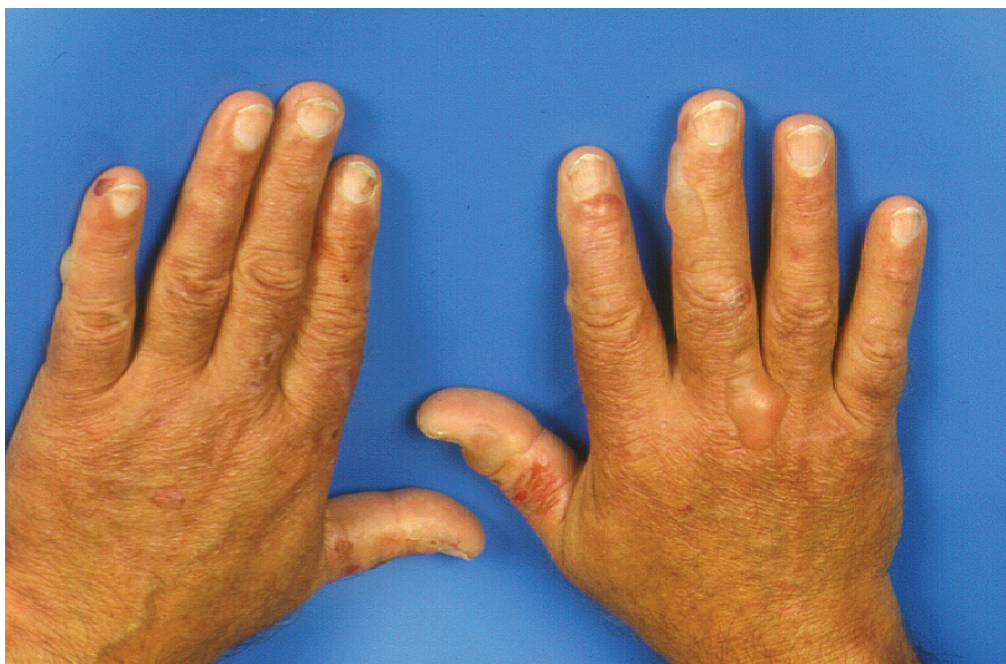
Fig. 1. Blisters and erosions on the fingers and the back of both hands in an individual suffering from overt PCT.

Histopathologically, 60 - 70 % of those individuals affected by PCT will develop hepatic siderosis (Uys and Eales 1963, Elder and Worwood 1998). Clinical and experimental studies suggest that UROD is reversibly inhibited by high iron concentrations (Sampietro et al. 1999). This is consistent with the observation that phlebotomy can lead to clinical remission and reversal of the metabolic defect (Lundvall and Weinfeld 1968, Sampietro et al. 1998). Several groups have studied the common HFE gene sequence deviations C282Y and H63D, providing evidence for increased frequencies of these molecular alterations in PCT patients from distinct ethnic origin (Hift et al. 1997, Roberts et al. 1997a, b, Santos et al. 1997, Stuart et al. 1998, Bonkovsky et al. 1998, Bulaj et al. 2000, Tannapfel et al. 2001, Furuyama et al. 1999).